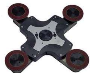
SHS 600 planet disk