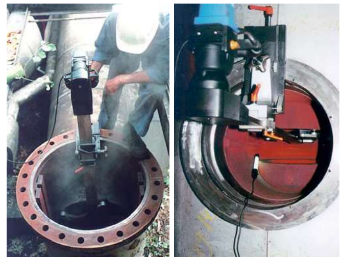
SHS 600 grinding on-site