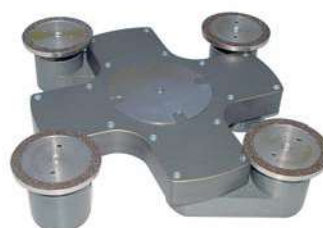
SHS 600 planet disk