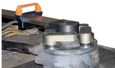
SHS 600 grinding of gate valve wedge